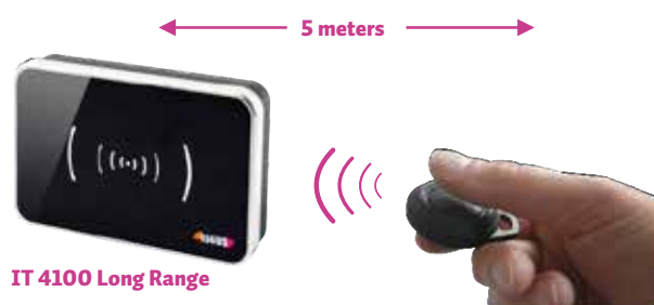
IT 4100 Long Range